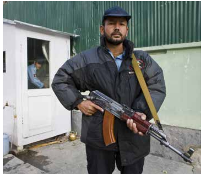
Photo: Private security guard

Businesses are limited in the type of weapons that can be employed for security purposes in times of conflict. Certain weapons, such as anti-personnel landmines, are explicitly banned in times of peace and in times of conflict because of their indiscriminate effect on civilians. Weapons with the potential to cause superfluous injury or unnecessary suffering are also banned.