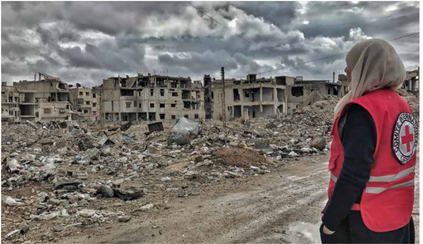
Photo: Rural Damascus, Mouadamieh