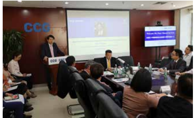
ICRC President, Peter Maurer, addresses representatives of Chinese business community

Moreover, business activities may be considered ‘closely linked to an armed conflict’ even if they do not take place during actual fighting or on the physical battlefield and even if the business did not actually intend to support a party to the hostilities. Given the difficulty in determining which business activities are or are not ‘closely linked to an armed conflict’, prudent corporate risk management would suggest a cautious