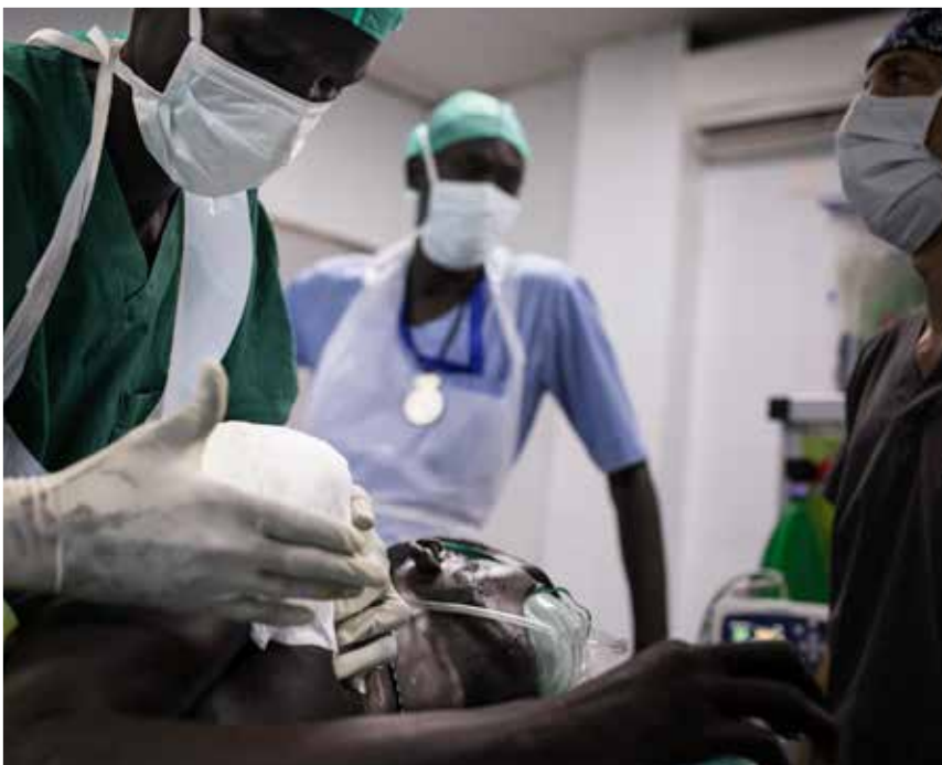
Photo: A patient with a firearm injury undergoes surgery in this hospital supported by the ICRC