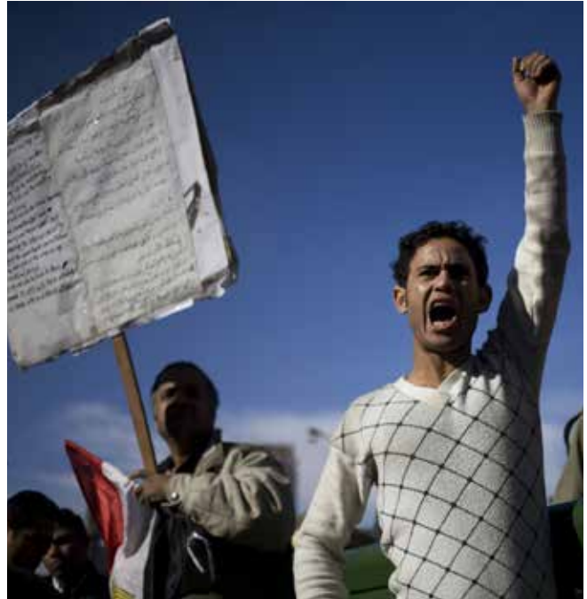
Photo: Protestors, Tahrir Square

A business that claims to observe best practice in respecting human rights should understand when and where the rules and principles of IHL apply, not only when conducting operations in a conflict zone, but also to sufficiently prepare yourself should the environment change.