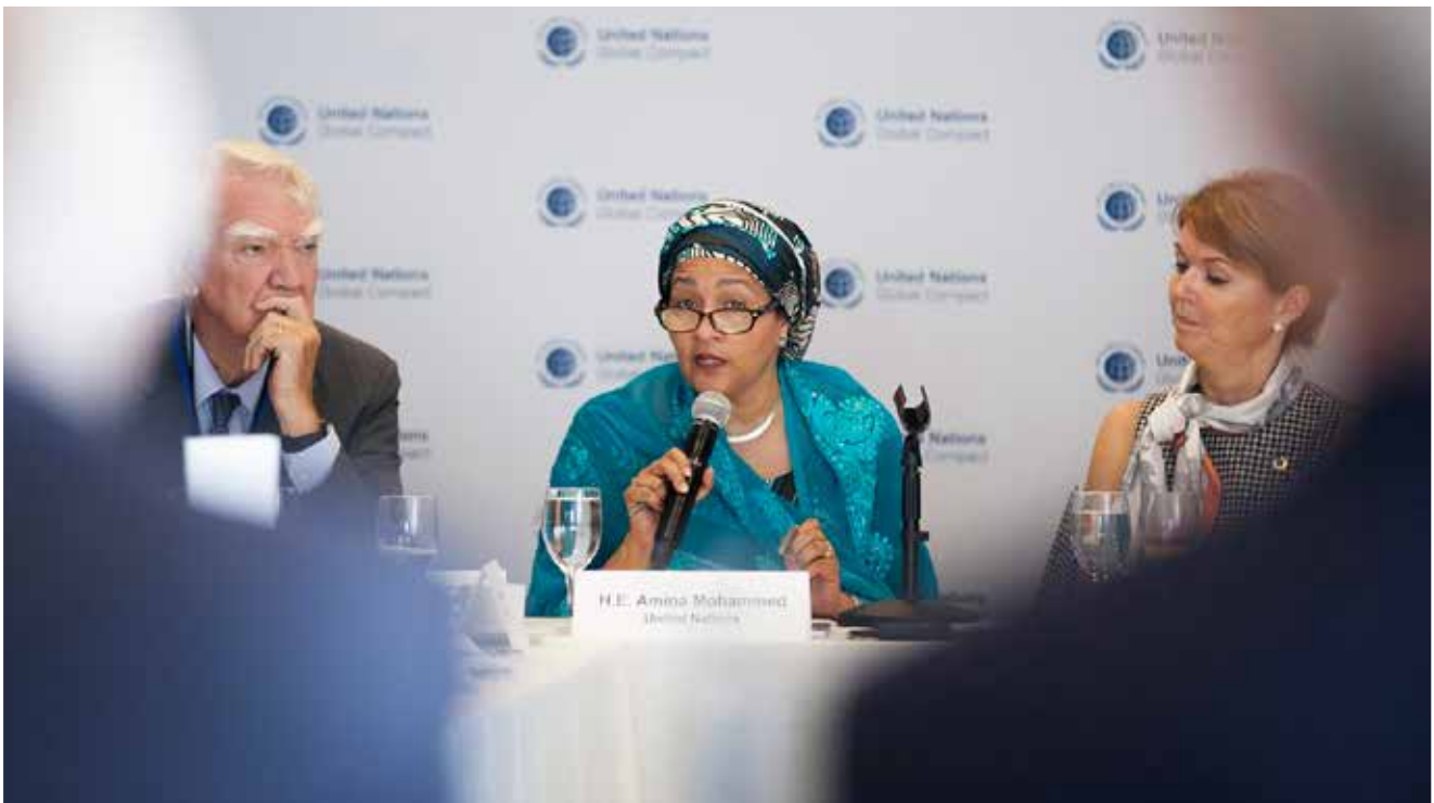
Photo: Inaugural CEO Roundtable Organized by UN Global Compact

A number of major global, multi-stakeholder initiatives that deal with business and human rights issues also call on companies in conflict zones to abide by IHL. Because of this, your business's existing human rights policies and commitments, for example on risk management and training, may already include requirements to respect and adhere to IHL.