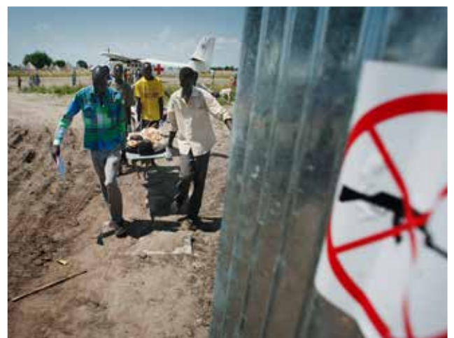
Photo: A war-wounded patient has been taken out of an ICRC-plane after been evacuated by a medical team - ICRC/Jacob Zocherman

Military force is not an end in itself – the only legitimate military purpose in an armed conflict is to weaken the military capacity of the other parties to the conflict. Parties do not have unfettered access to war tactics and weapons. Only means and methods that are necessary to accomplish a legitimate military purpose, and are not prohibited by IHL, are permitted.