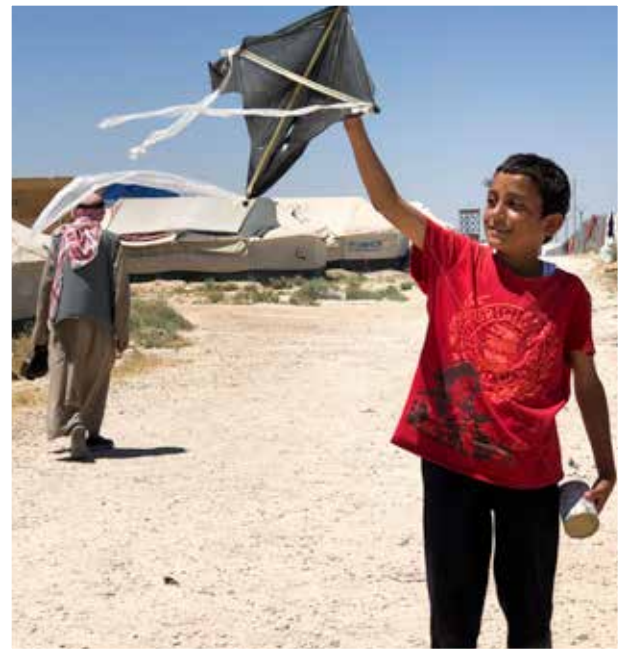
Photo: North East Syria, Al Hassakeh Governorate, Al Hol camp for internally displaced persons - ICRC/Ali Yousef

The sick and wounded must be cared for humanely and without distinction. Medical personnel, hospitals and ambulances must never be targeted. They must be respected and protected. The distinctive red cross, red crescent and red crystal emblems and other officially-recognised symbols indicate that the building displaying the emblem, or the person wearing it, must not be attacked.