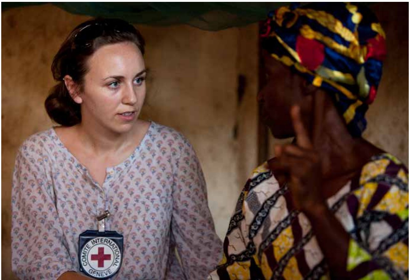
Photo: Bangui, Bimbo women's prison. An ICRC delegate talks to a detainee

As a testament to the accepted nature of these laws, all countries have ratified the Geneva Conventions, and the vast majority are parties to the 1977 Additional Protocols.