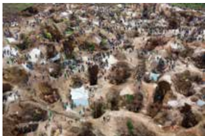
Front cover photo: Luwowo Coltan mine near Rubaya, North Kivu, MONUSCO/ Sylvain Liechti