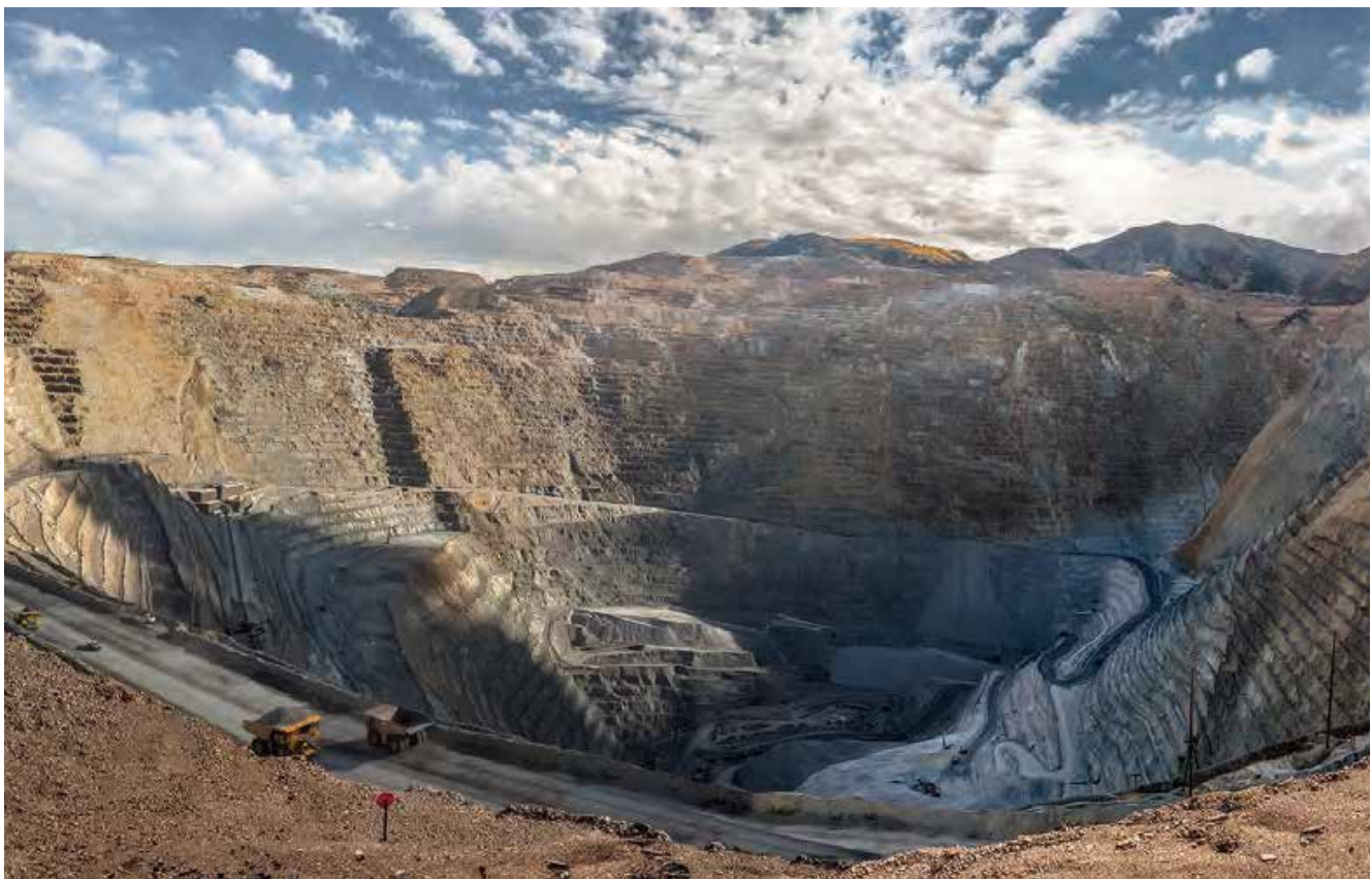
Photo: Open-Pit Mine

Businesses are generally less familiar with their responsibilities, and the protections afforded to them, under IHL. This lack of knowledge is problematic, as there are important implications for doing business in regions experiencing or at risk of armed conflict.