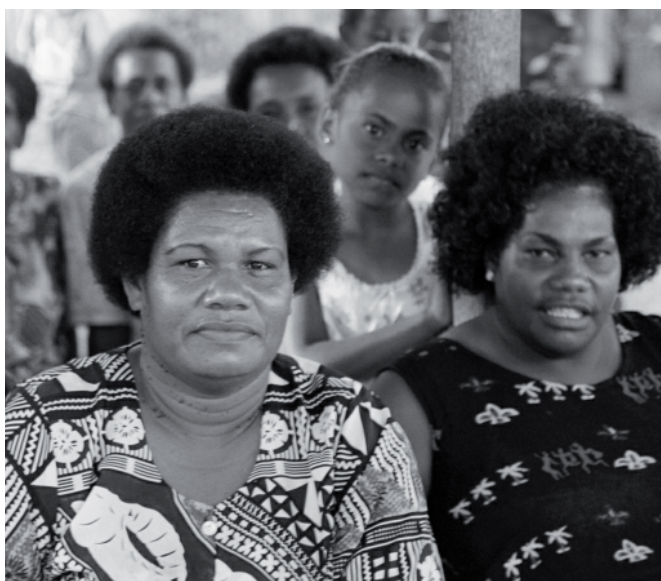
Women attending a community meeting express their grievances with the owners of the Vatukoula mine in Fiji.

This report presents a gender impact assessment framework to help assess and then avoid the potential negative gender impacts of a mining project. This framework should be adapted as necessary for the specific situation or context and is summarised below.