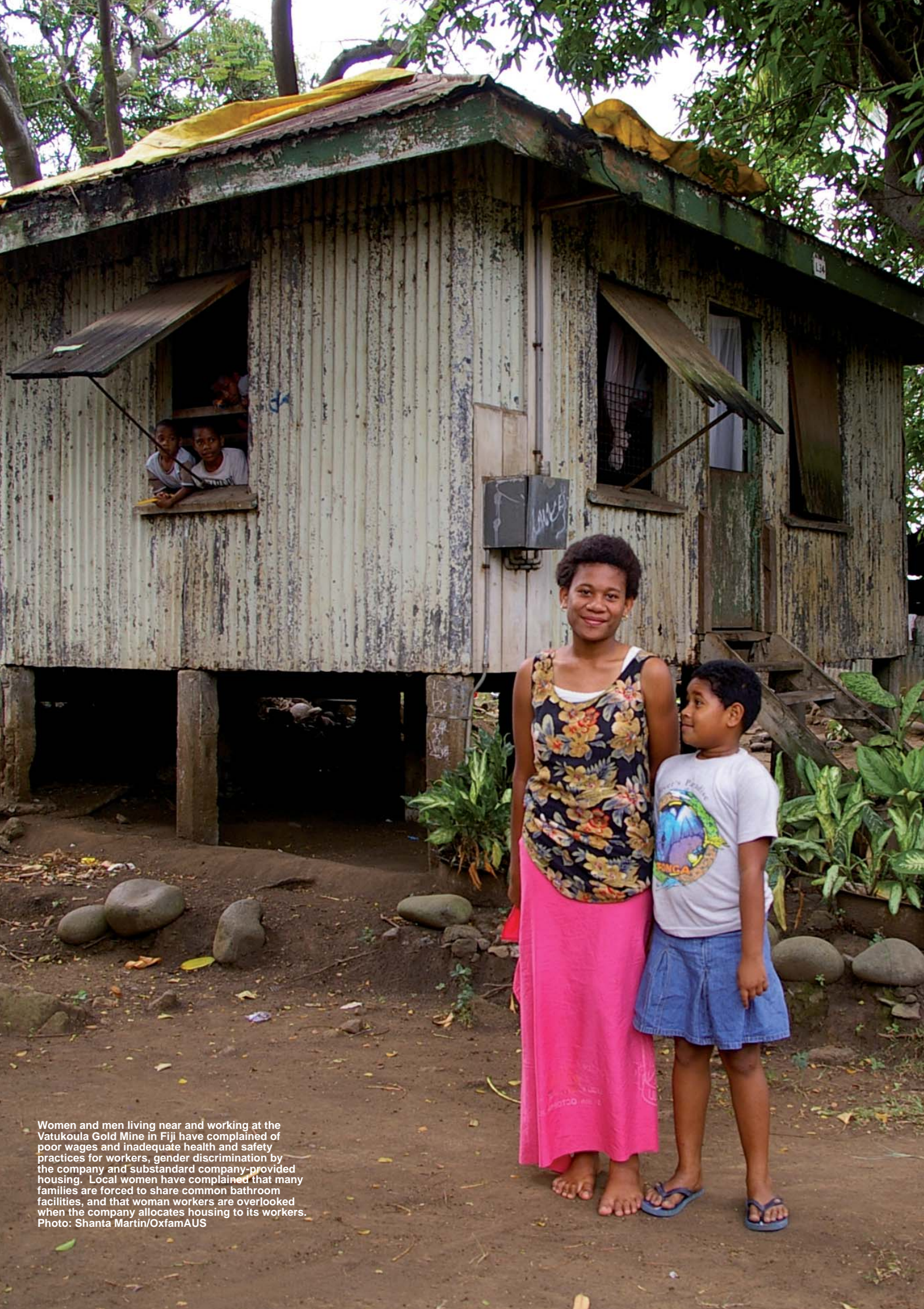
Women and men living near and working at the Vatukoula Gold Mine in Fiji have complained of poor wages and inadequate health and safety practices for workers, gender discrimination by the company and substandard company-provided housing. Local women have complained that many families are forced to share common bathroom facilities, and that woman workers are overlooked when the company allocates housing to its workers.