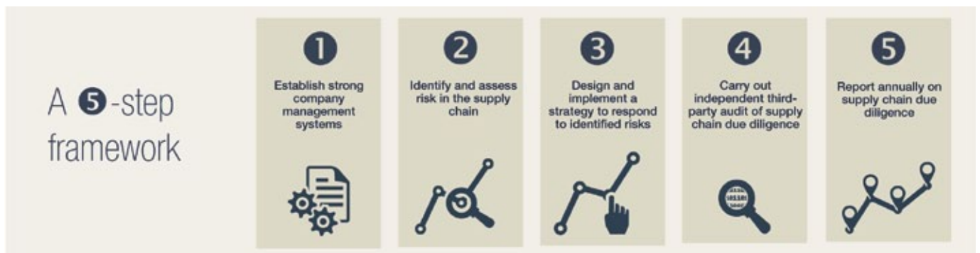
Figure 1: OECD five-step framework 18

The model mineral supply chain policy recommends that companies that foresee the need to contract public and/or private security forces should commit to the Voluntary Principles. The VPs also feature in the suggested measures for risk mitigation and in the gold supplement (but not explicitly in the 3T supplement). 17